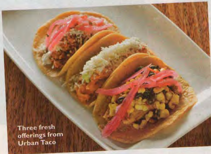
Three fresh offerings from Urban Taco