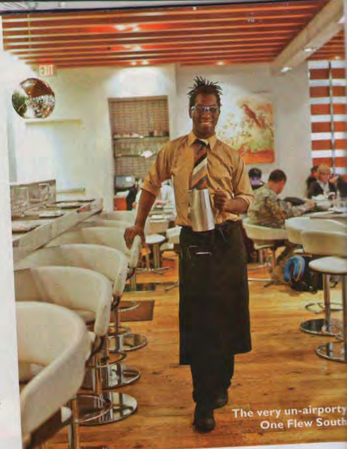
The very un-airporty One Flew South